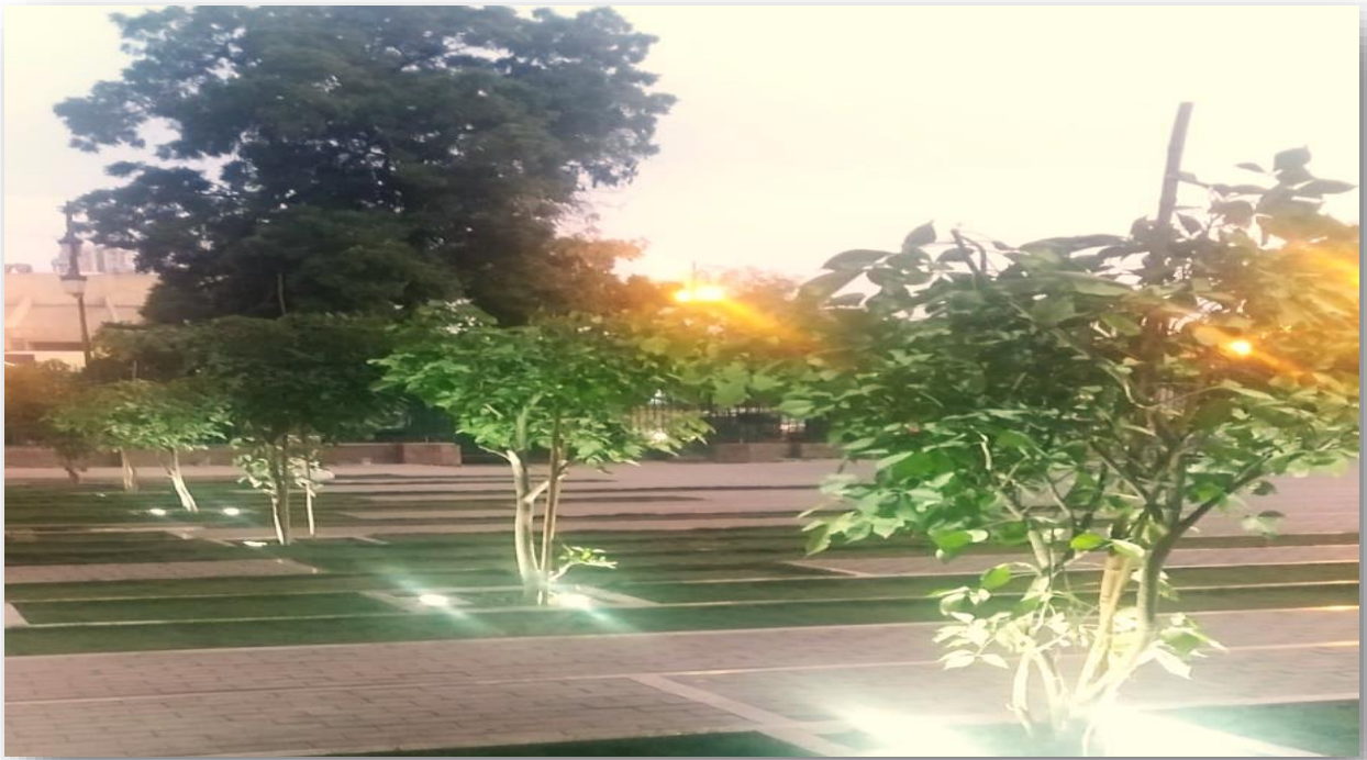
Art Council after rehabilitation and Renovation