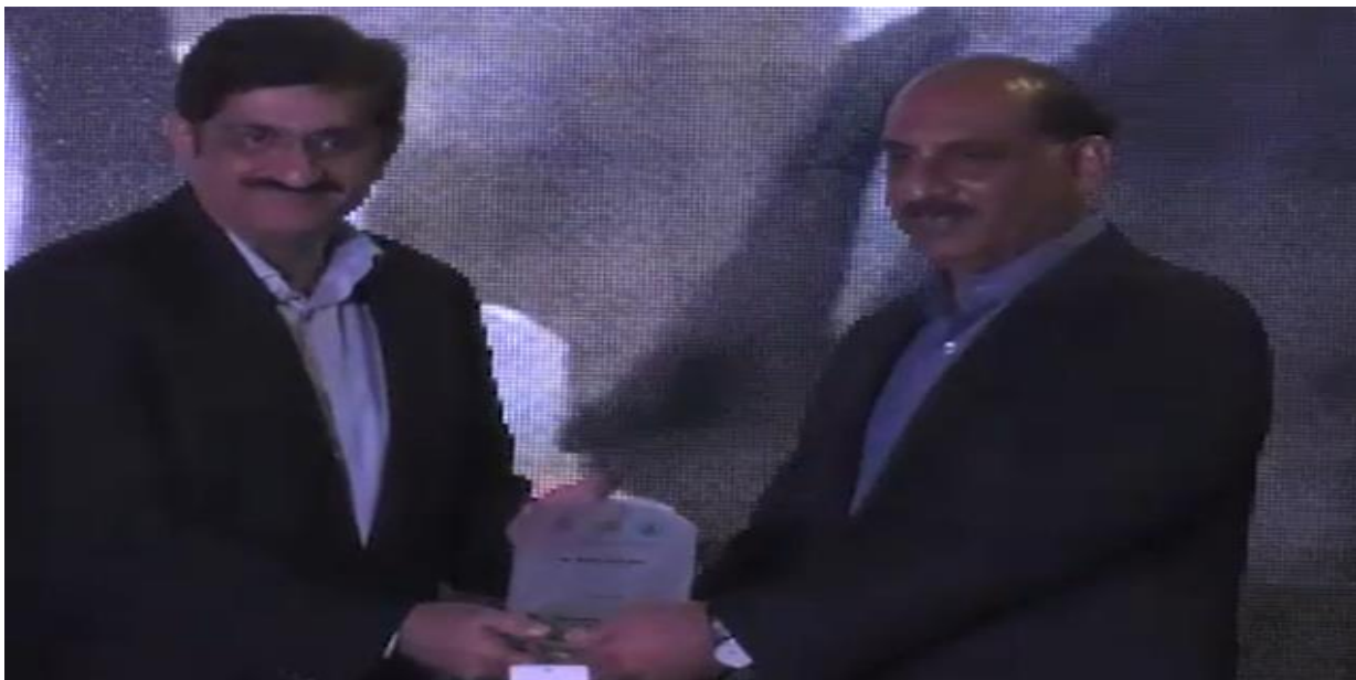
CM Sindh presented Shield to PD KNIP