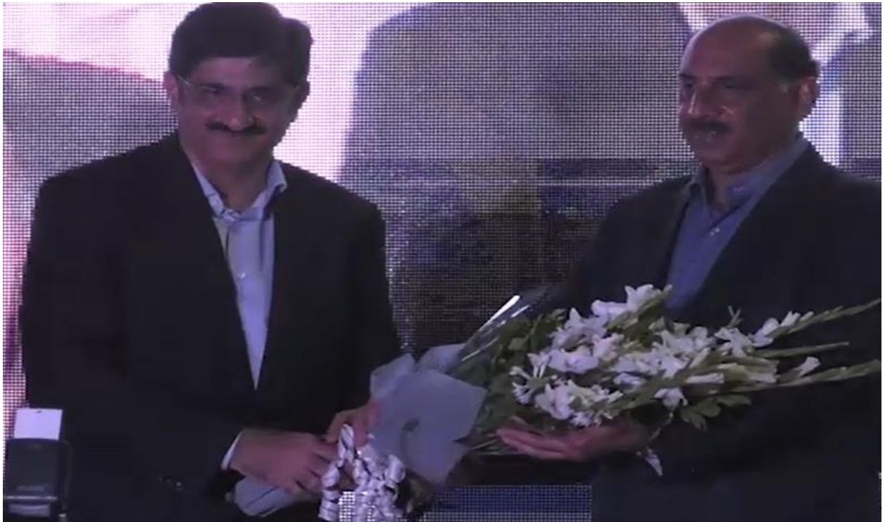
A bouquet presented to PD KNIP by CM