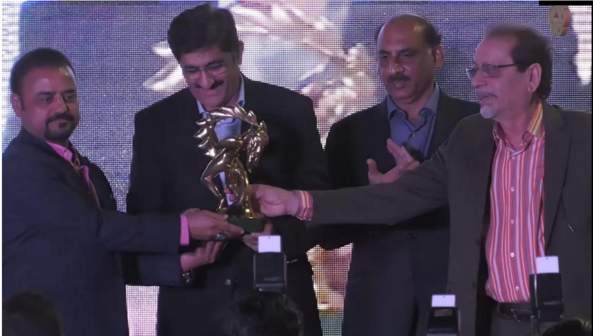
A piece of Art is presented to CM and PD KNIP