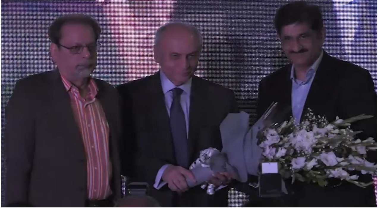
A bouquet presented to CM by Secretary Art Council