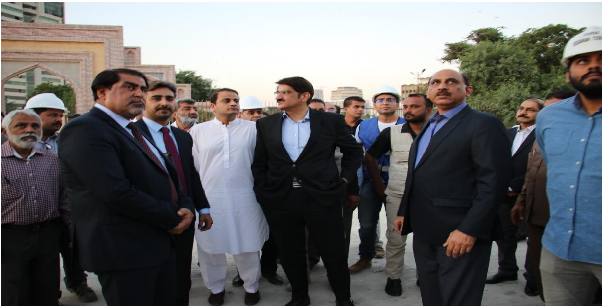
CM Sindh visited Parking Plaza