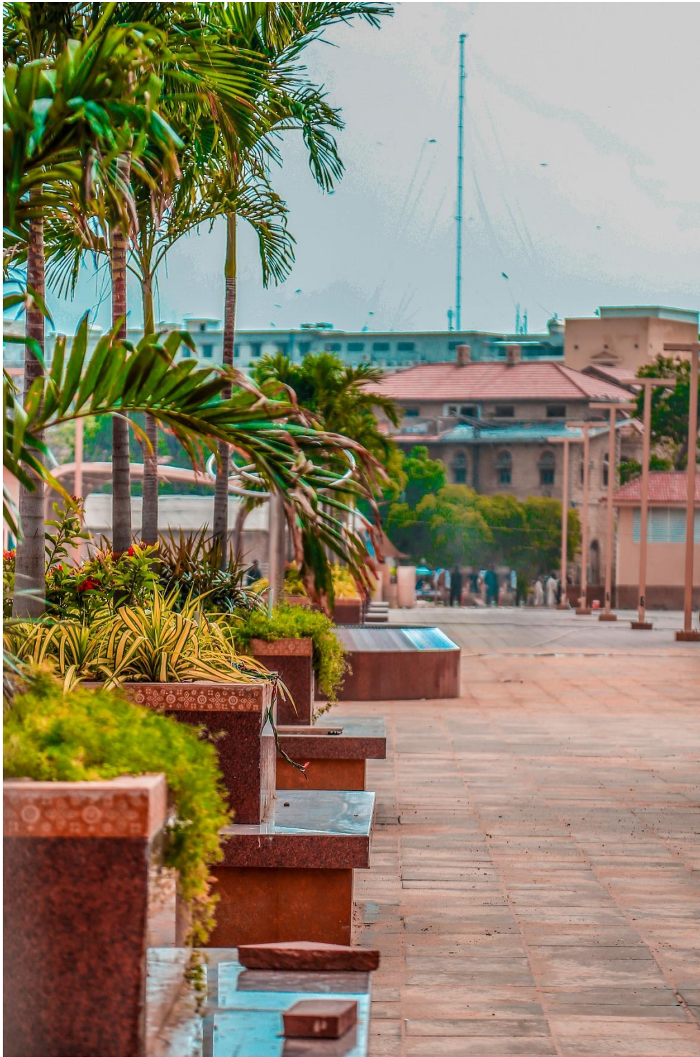
“Tree Planters Surrounded by Seating Space”

Especially designed granite stone finished tree planters with Malaysian palm and Goldmohur trees have been constructed. The planters are designed in such a manner that 12 persons can easily enjoy the ambiance while sitting around on benches designed around planters.