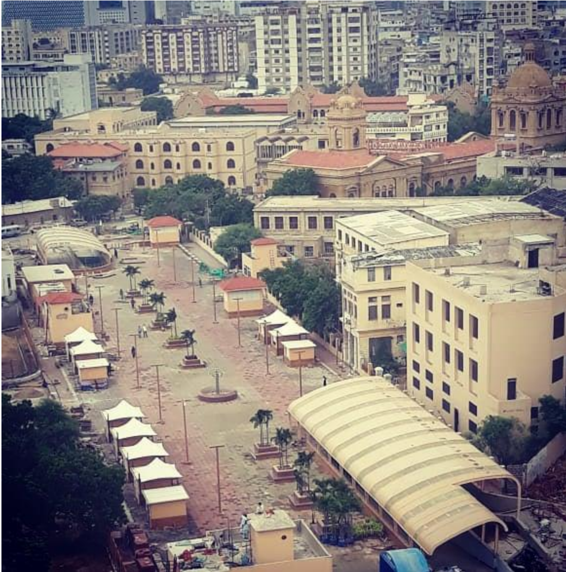
Top View of "People's Square" among the Urban Fabric