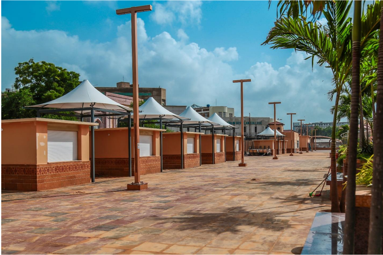
Picture showing series of Kiosk in People's Square