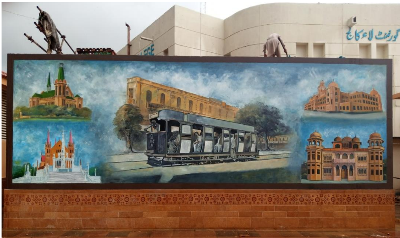
"Historic buildings of Karachi"