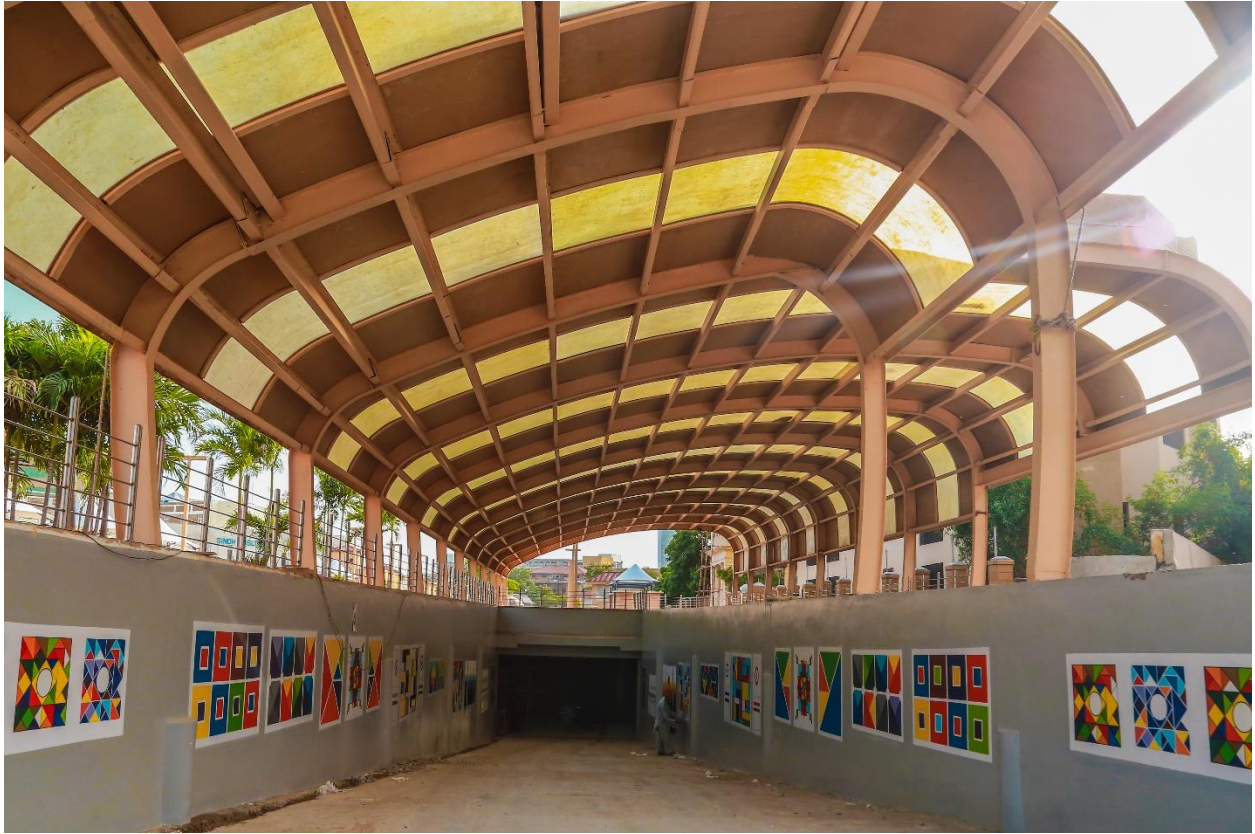
“Covered Parking Entrance and Exit Ramps”