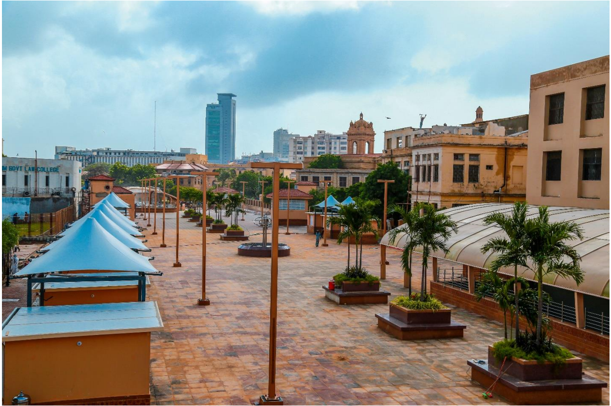
“Seating designed at People’s Square”