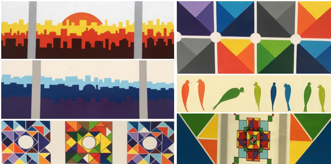
“Harmony in diversity through colors/shapes”