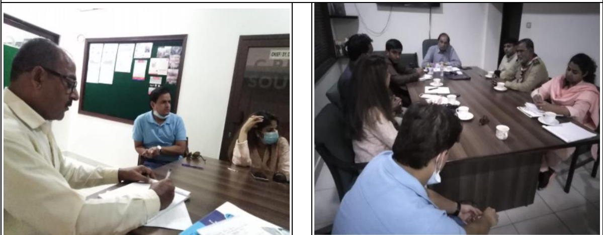
Taking suggestion from the participants